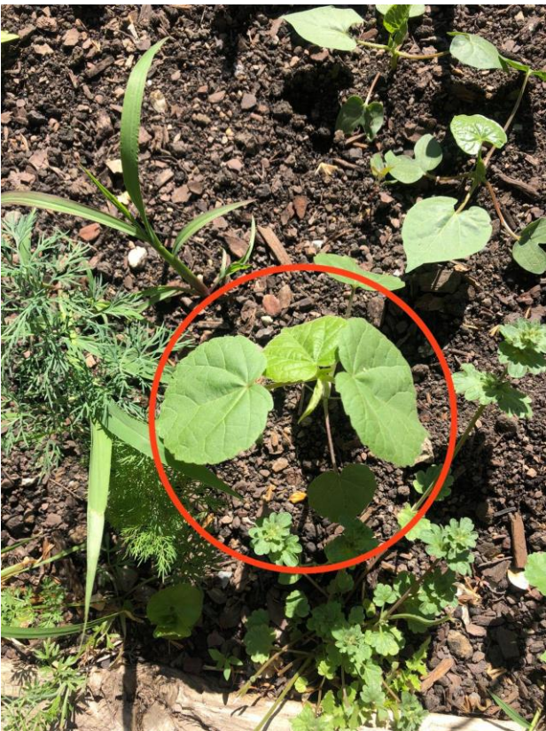
Kind of looks like morning glory, but it isn't.